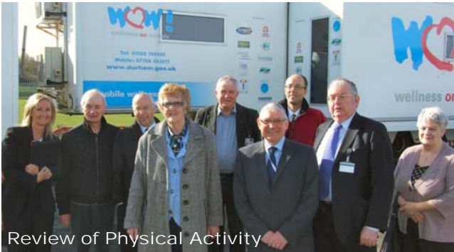
Review of Physical Activity

Review of Physical Activity which looked at addressing the gap in life expectancy that exists across County Durham by focusing on physical activity