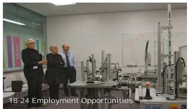
18-24 Employment Opportunities

Increasing Young Peoples' Employment Opportunities (18-24 years) which focused on an examination of how Durham County Council and its Partners can increase young people's (18-24 years) employment opportunities by further developing support for and engagement with employers in County Durham.