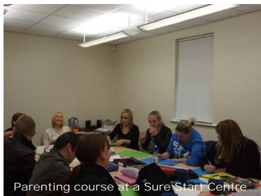
Parenting course at a Sure Start Centre