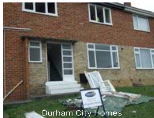
Durham City Homes