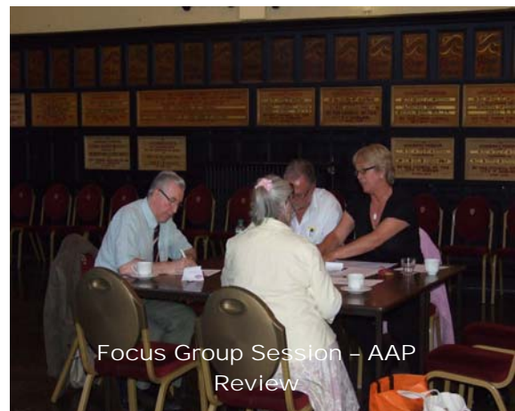
Focus Group Session – AAP Review