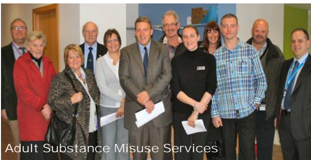
Adult Substance Misuse Services

Adult Substance Misuse Services 'From Treatment to Recovery' which focused on developing recovery based services within the context of the Government's Drug Strategy and Health and Social Care Bill.