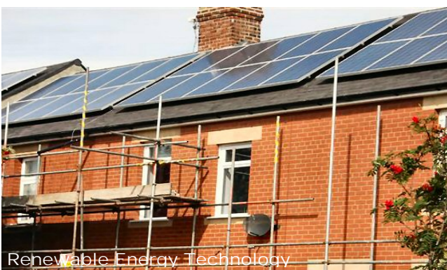
Renewable Energy Technology

Development of Renewable Energy Technology in County Durham , which examined the environmental, economic and social benefits to County Durham of investing in renewable energy.